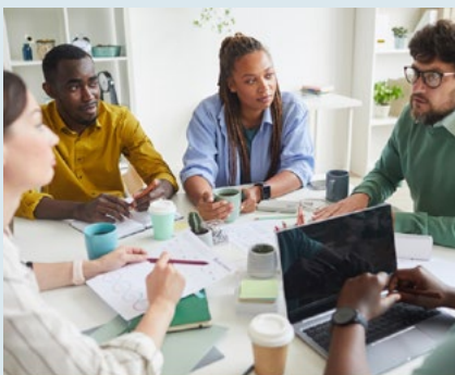
Expands the Parenting Paradigm