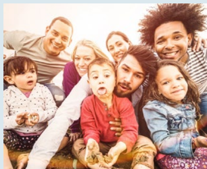
Relatable for Families