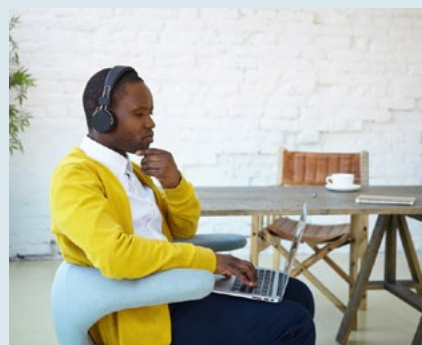
Flexible / Multi-use